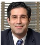
Bassem Safadi Lebanon